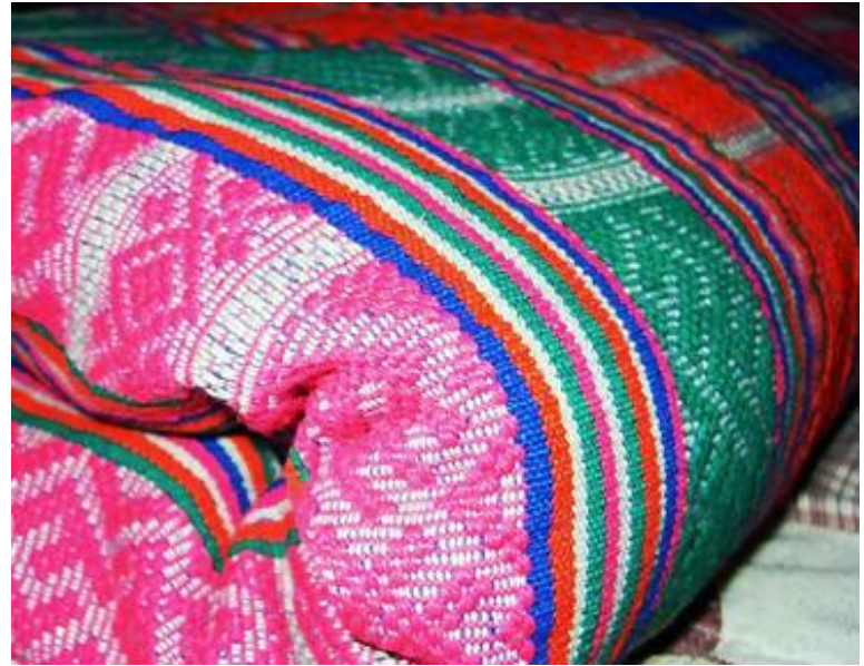
The quilt and how it is made