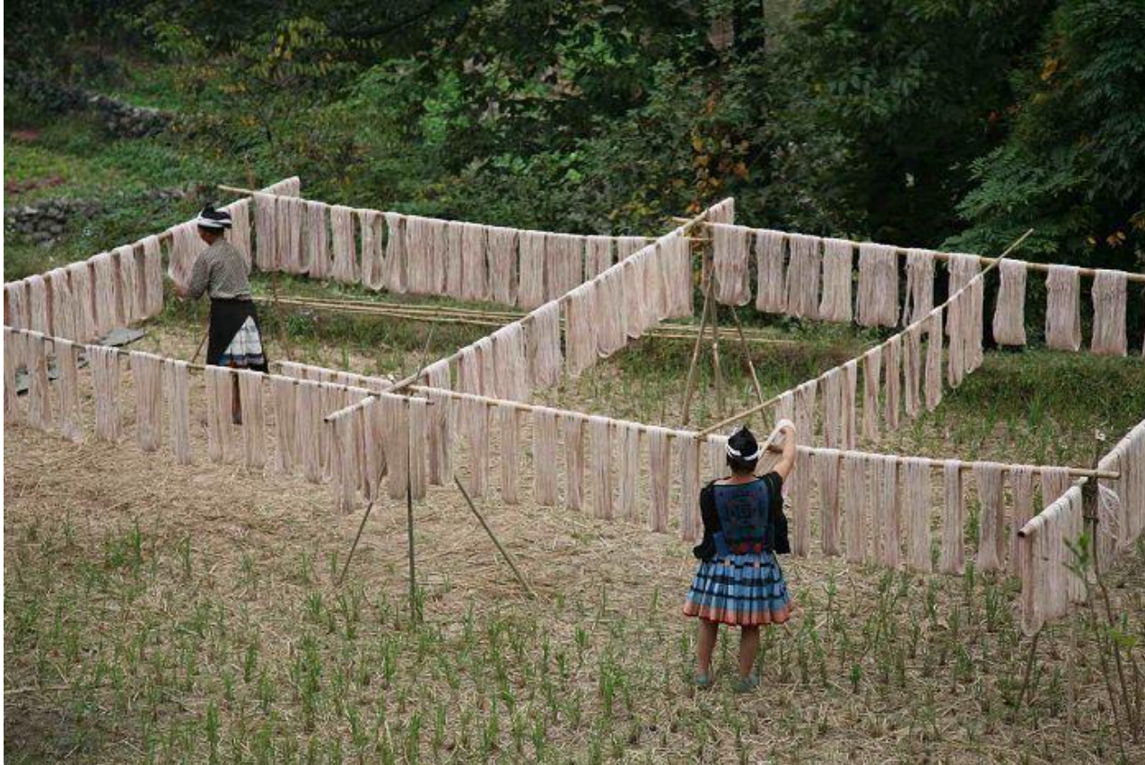
(3) Drying yarn