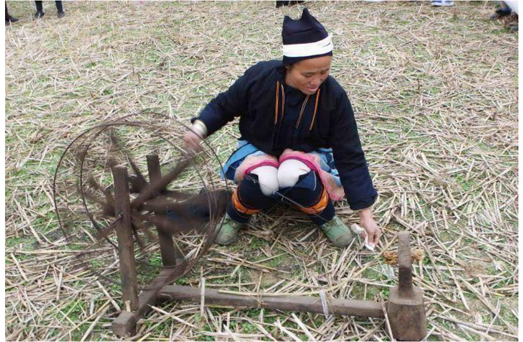
(1) Raw material -cotton