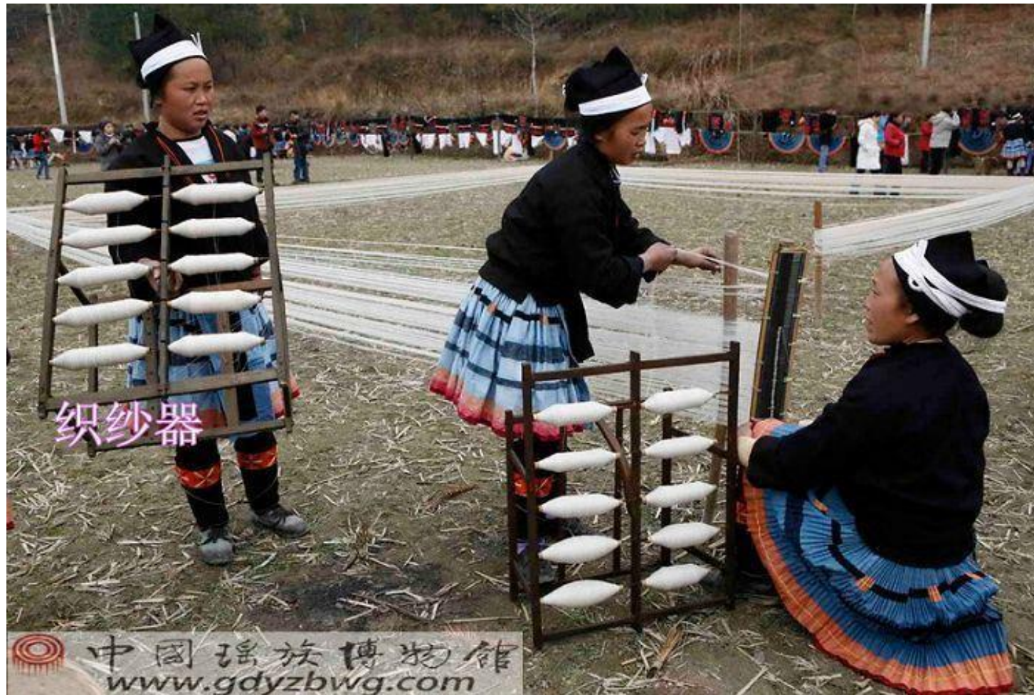
(4) Finished yarn